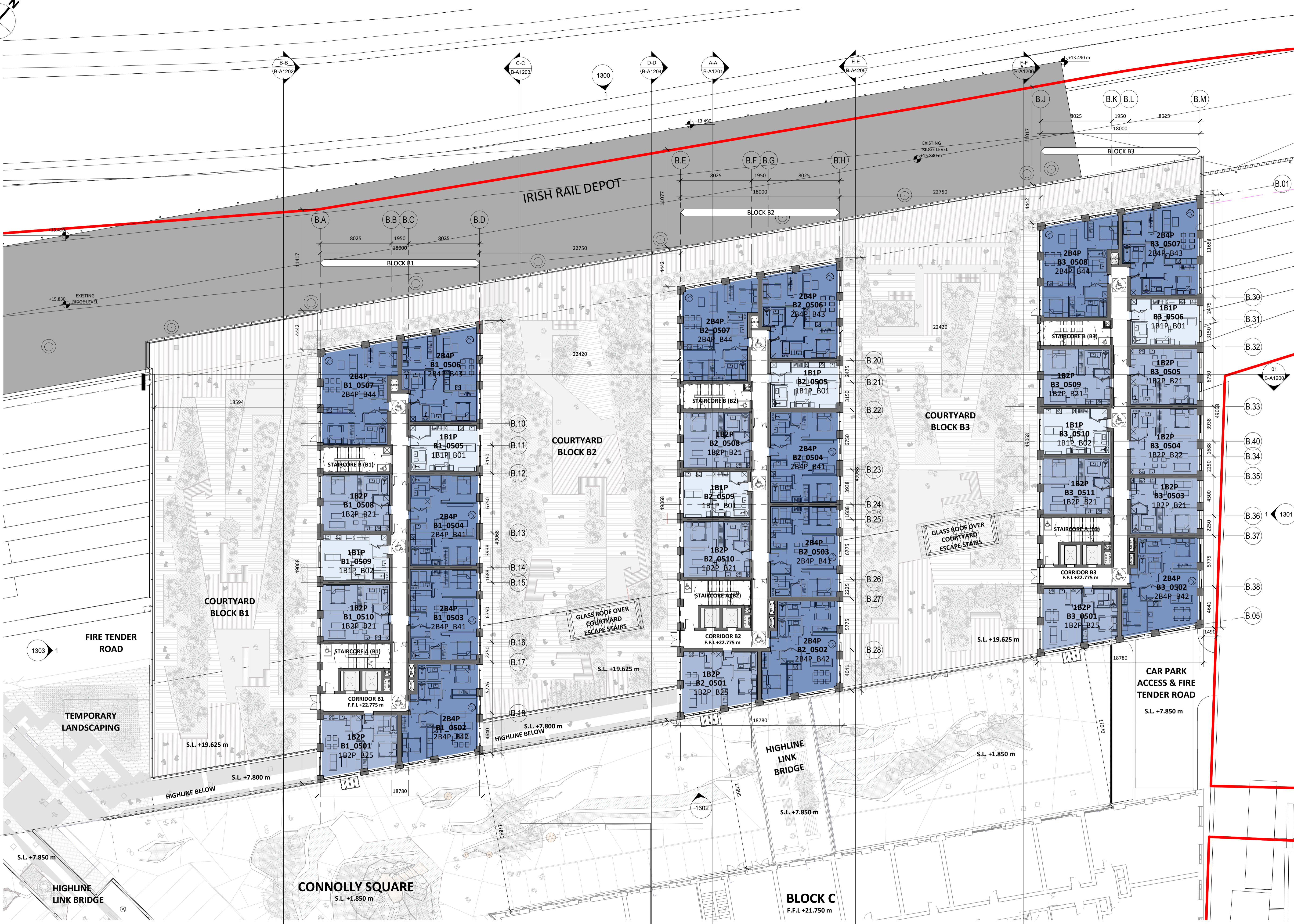
1 BLOCK B PLAN_LEVEL_05 1 : 200

ARROW Name: Færinngagade 13, 41 m DK-1364 Copenhagen K Denmark